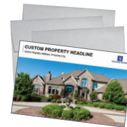
Silver Envelope Home Announcement